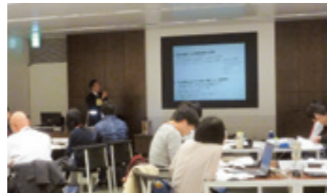
A Look at a Training Program