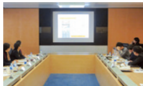
A Look at a Meeting